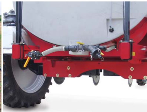
The plumbing and wheel adjustments are conveniently located for easy access.