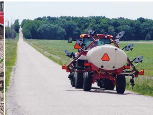
Wings fold over center for safe and convenient transport when moving from field to field.