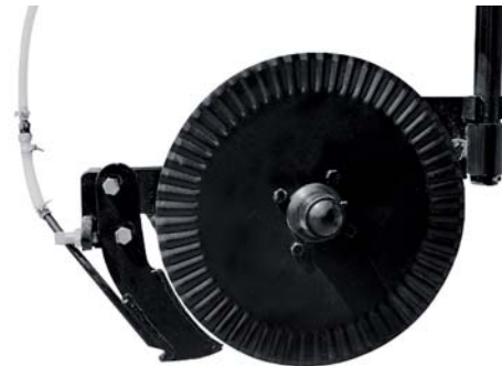
The cast chromium carbide 1/4 in. knife assures that all liquid fertilizer is applied at knife depth. Minimum 10 PSI is recommended.