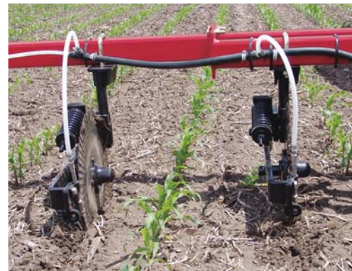
Sidedressing plant rows maximizes nutrient uptake during the critical part of the growing season.