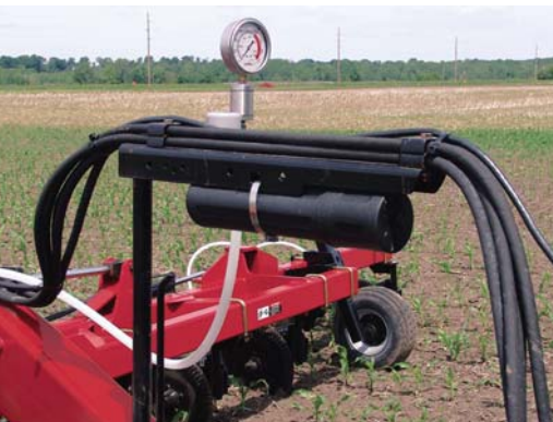
The front hose stand keeps hoses and wires away from the tractor hitch.