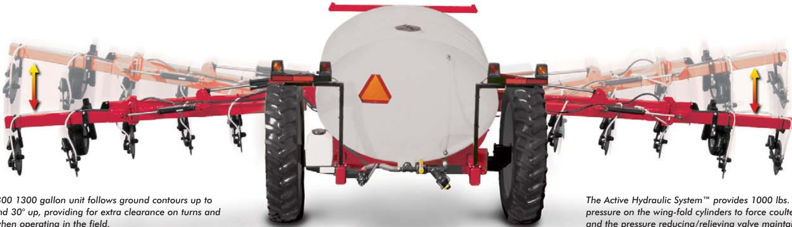
The NPX2800 1300 gallon unit follows ground contours up to 6° down and 30° up, providing for extra clearance on turns and flexibility when operating in the field.

The toolbar is available with either a liquid coulters knife or injector. When sidedressing with a liquid injection applicator, it is very important to have a high-quality injection coulters. This will allow fertilizer to be injected into the soil to the full coulters depth, where it can be captured by roots and not tied up by surface residues.